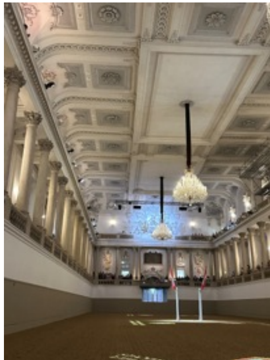
Spanish Riding School Arena