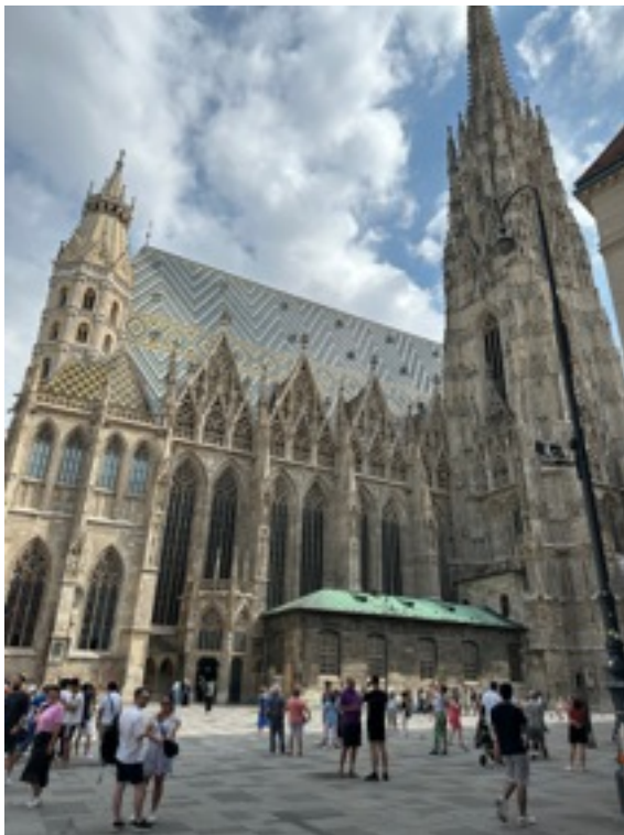
St. Stephen's Cathedral in Vienna