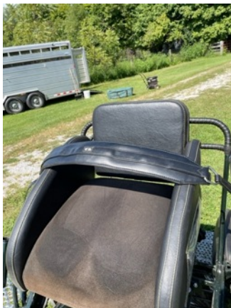
Seat belt on marathon vehicle

The seat belt is buckled to the carriage on ONE side and ONE side only! The other side is a strap with no holes, no buckle-nothing to tie it to the carriage.