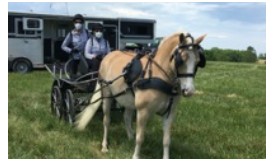
SCHEDULE OF EVENTS FOR 2021