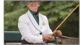
OPEN SCHOOLING DAY: CHARLOTTE'S CREEK, SUNDAY MAY 16