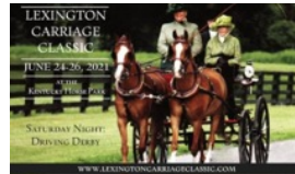
LEXINGTON CLASSIC: KENTUCKY HORSE PARK, JUNE 24-26