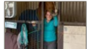
MEMBERS ACTIVITIES AND AWARDS WINTER: 2021