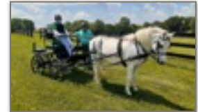
THANKS FOR A FUN TWO YEARS!