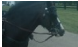
EARLIEST SCHEDULE OF EVENTS FOR 2021