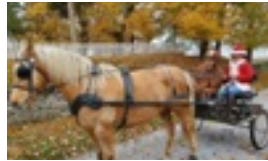
THE YEAR IN REVIEW

WELCOME TO NEW EXECUTIVE BOARD OFFICERS!