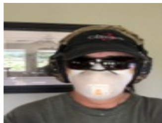
Your New Fearless Leader!

Even though it looks like good news is on the horizon, we continue to observe our COVID-19 Rules that were put into place last year. The rules will be in effect until we have been given an all clear by the CDC, the United States government, and state government. This means, we all still must wear masks as we meet and we are still practicing social distancing. For the time being, there will be no indoor activities at least through January and February.